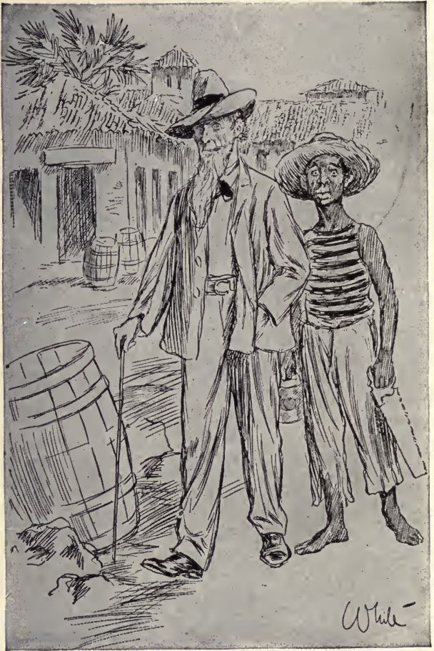
"The old medical outrage . . . had a nigger along."